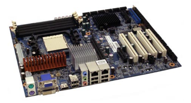
Figure 1: The Kontron KT780/ATX basic motherboard with integrated ATI Radeon HD 3200 graphics

The Kontron KT780/ATX basic motherboard exactly meets these demands. It outstrips the longevity of any consumer motherboard, thus reducing the design risk. At the same time it offers a reduced longevity compared with embedded motherboards. Together, these factors reduce the total cost of ownership for embedded applications with relatively fast innovation cycles.