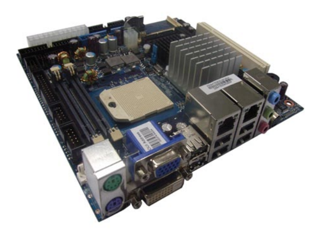
Figure 3: The Kontron KT690/mITX embededded motherboard

performance-per-watt, thanks to the AMD Sempron™ single core and AMD Turion™ 64 X2 dual core processors. The Kontron mini-ITX motherboard also offers increased graphics performance with the integrated Radeon™ X1250 Graphics Core.