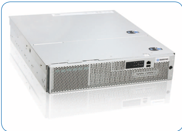
The Kontron CG2100 is a NEBS-3 and ETSI-compliant 2U rack mount server that features the company's proprietary vibration suppression technologies.

The proprietary vibration suppression technologies in Kontron's communication rack mount servers are designed to significantly reduce the amount of vibration by isolating both vibration-generating devices and vibration-sensitive devices. The company's 1U and 2U Carrier Grade and IP Network servers utilize a unique vibration-absorbing material allowing its designers to isolate both the fans and hard drives from direct contact with the system's metal infrastructure so they literally "float" inside the chassis. This approach requires that the initial system design includes vibration suppression as a key requirement. For example, the typical enterprise server hard drive "cage" is integrated tightly with the main chassis walls and/or floors. While this is efficient from a design point-of-view, it allows vibration to be transmitted directly to the hard drives. And while the drives can be, and should be, isolated from the cage, Kontron has found that creating a self-contained drive cage and isolating the entire cage from the chassis greatly reduces vibration-induced performance loss of the drives over drive isolation alone.