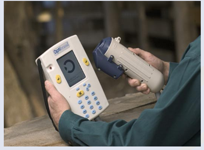
Optibrand and current procedures

Although the Optibrand system works as the only identification and retracing solution, it is designed to work together with the existing and legally prescribed marking systems. Barcode readers and RFID receivers - for the handling with normal and electronic earmarks respectively transponders - can be simply connected wireless to OptiReader via Bluetooth or via USB port by cable. The current earmark system and future solutions with electronical marking can be optimized as follows: