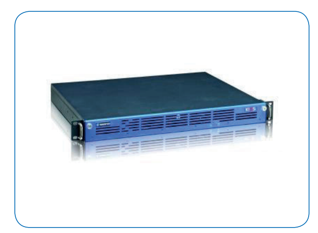
Image2: KISS 1U Short KTGM45